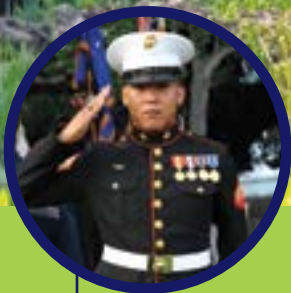
National Memorial Day Concert