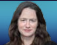
Heather Cox Richardson