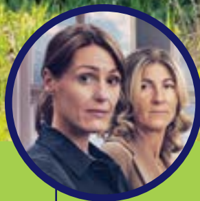
MaryLand on Masterpiece