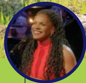
Great Performances Presents Broadway's Best